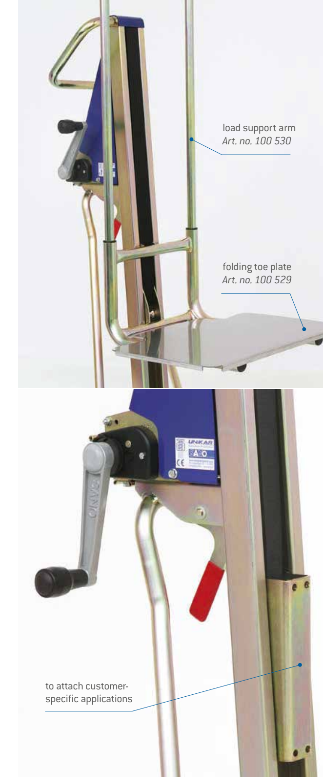
load support arm Art. no. 100 530

The standard version of the UNIKAR lifting hand truck is supplied with a lifting height of 1100 mm. Additional lifting heights of 1300 mm up to max. 1600 mm are available on request (intervals of 100 mm).