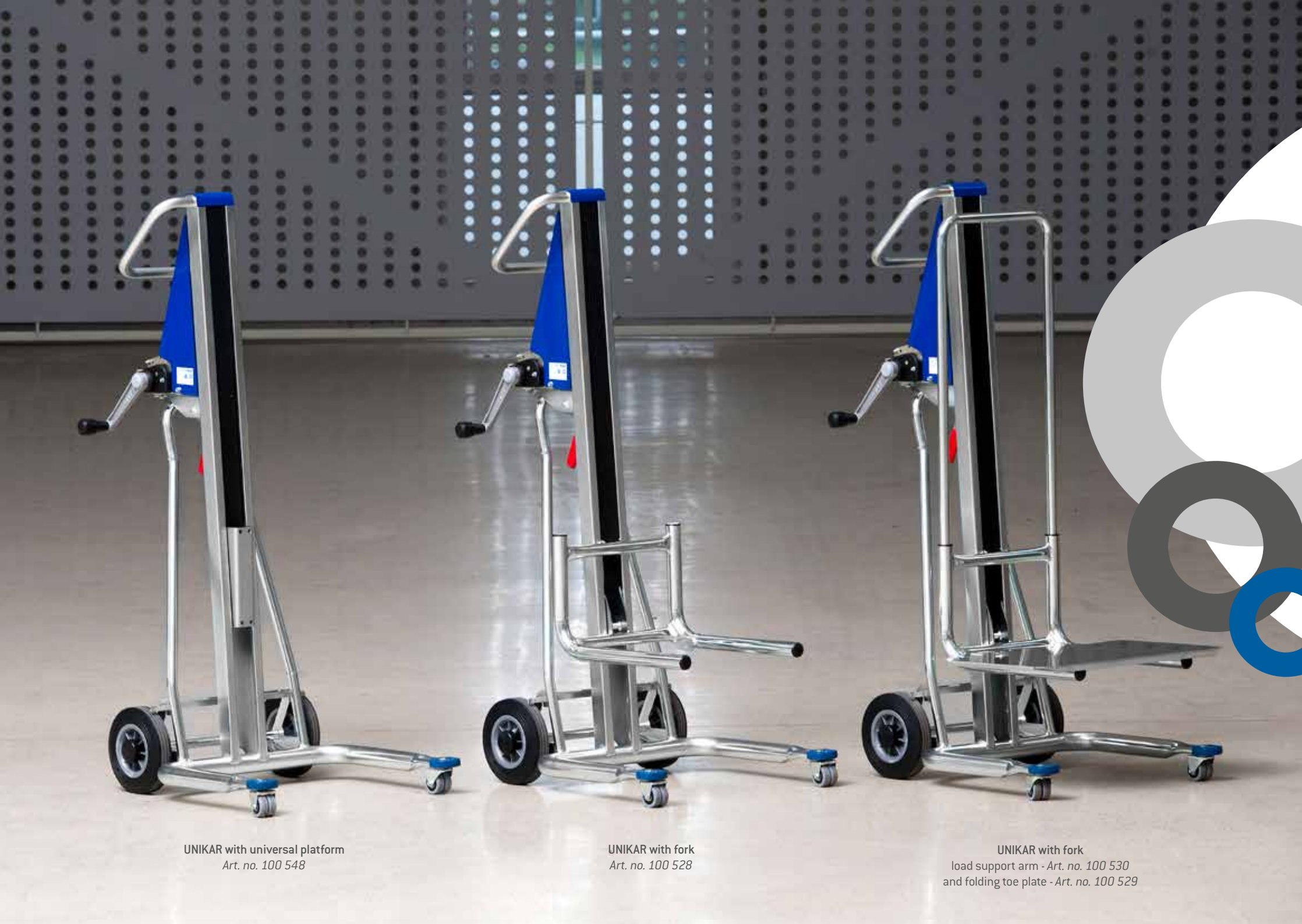
UNIKAR with universal platform Art. no. 100 548